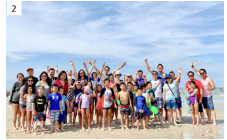
1) Prayer walk 2) Annual camping trip