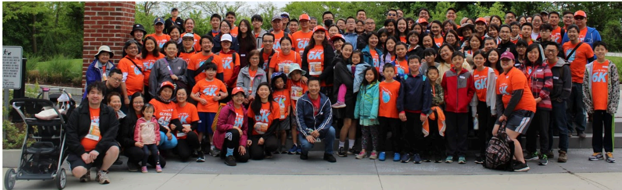
Top: Brothers and sisters from Boston Chinese Evangelical Church joined with other believers to serve food to homeless and needy individuals at Boston Rescue Mission; Bottom: Boston Chinese Evangelical Church participated in the Global 6K for Clean Water at Arsenal Yards