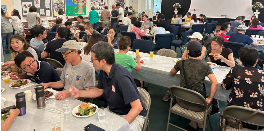
Left: Elderly house visitation; Right: Fellowship lunch gathering