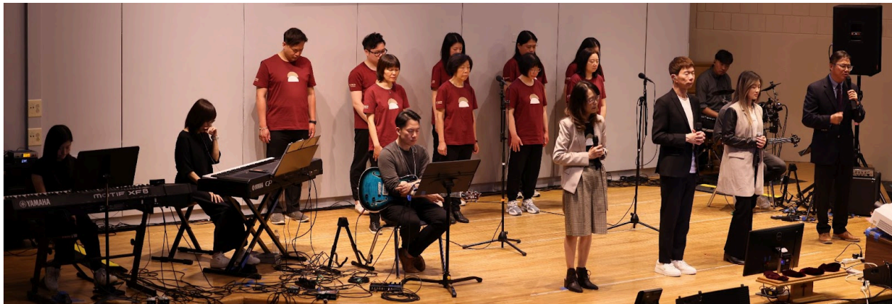
Top: Chinatown Cantonese service lunch; Bottom: The Heralders visit BCEC