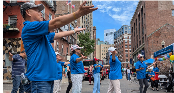
Worshipping at Autumn Moon Festival

Our Chinatown Mandarin ministries have experienced the third wave of the Eastern Lightning infiltration of heresy, testing whether we can clearly distinguish between heresy and the truth of God's Word. We thank the Lord that in our fellowships, Sunday School classes, and Bible study discussions, we can feel the fire of God's Word in our hearts. This brings us awareness for the need to repent, as well as to humbly trust in God in the midst of suffering. In addition, when our worship service tried sign language dancing, praise songs were vividly expressed, praising God in the field and praising God at the Mid-Autumn Festival booth in Chinatown Boston. Moreover, it was a time of reflection and introspection after the pandemic. We cherished the precious time for the members of Christ to exhort each other. Lastly, we truly give thanks for being able to see each other in person again, and carry each other through the difficult times in the last several years.