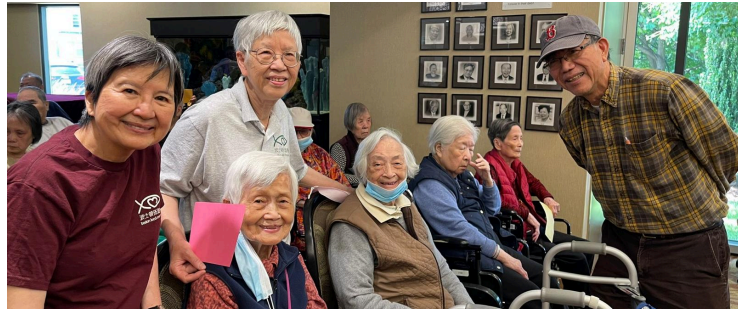
Visiting the elderly

On the whole, the church has gradually regained its vigor after the pandemic, and people have begun to shake off the shadows of the pandemic. However, the pace of change has not slowed down, and emerging topics like artificial intelligence has society looking forward to a new era with mixed feelings. We need to dream for the future, and at the same time, we need to promote intergenerational fellowship and the inheritance of the Christian faith.