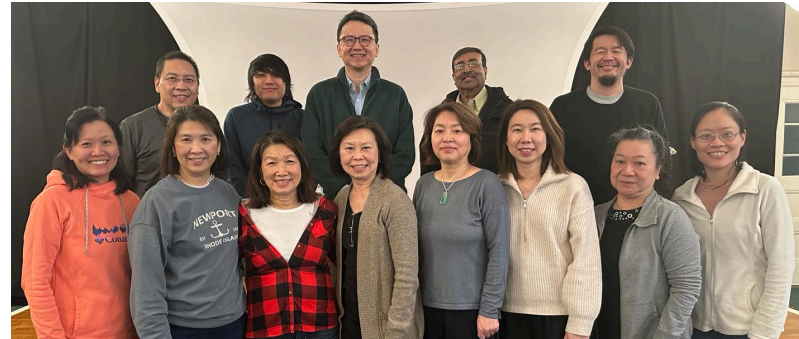
Newton Alpha Course