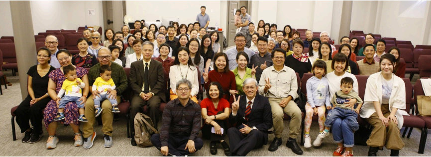
Top: Young Adult group gathering; Bottom: 10-year Congregational Celebration group photo