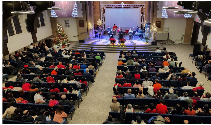
Left: Chinatown Mid-Autumn Festival; Right: Joint Chinese Christmas Eve service at Newton Campus