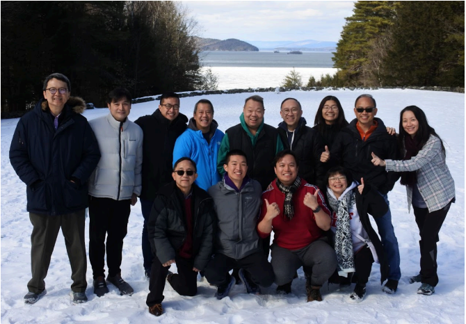
Board of Deacons at Retreat