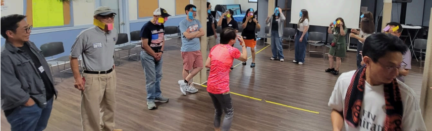
Various Fellowship gatherings