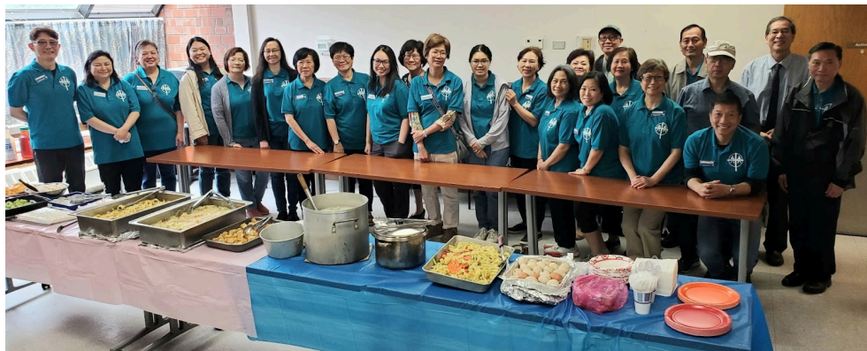
Top Left: Chinese New Year Celebration; Top Right: Chinese Youth Fellowship activities Bottom: Stephen Fellowship with graduating students and guests